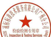
Zm guan Approved Signatory