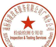
Zm guan Approved Signatory