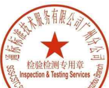
Zm guan Approved Signatory